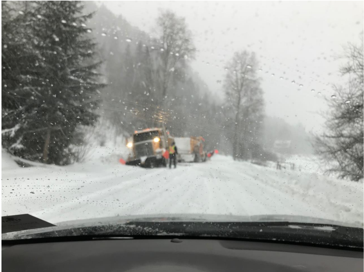
Snow plow stuck in the ditch, during pre-run of TBird 2018