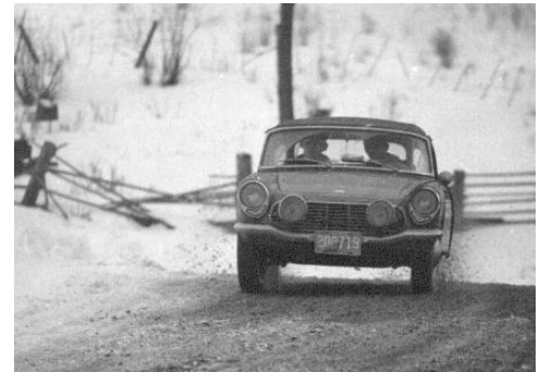
Dave Fairhall, Honda S600, on Mamette Lake Road, TBird 66